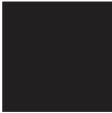
Full Page with Bleed (color only): 8.75" x 8.75" (Trim= 8.5" x 8.5") (Live= 8" x 8")